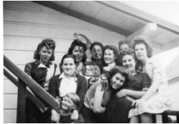
Title: Pacofi Ladies Date: 1941 Primary Maker: Edna Piket (Beavan) Medium: Prints