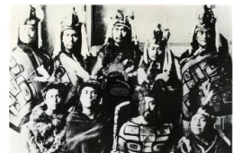
Title: Group of 9 men in Regalia Date: u/k Primary Maker: u/k Medium: Prints