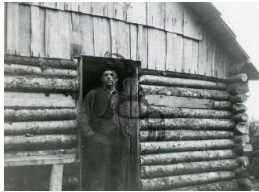
Title: Sandspit Man Medium: Prints