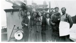
Title: Sandspit Group Medium: Prints