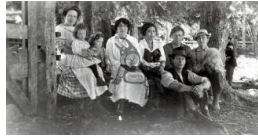
Title: Tlell Group Medium: Prints