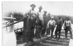
Title: Mayer Lake - Logging Crew Medium: Prints