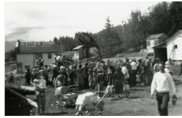
Title: Queen Charlotte City Date: 1951 Medium: Prints