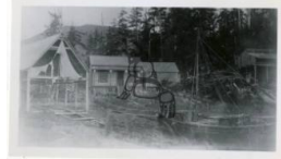
Title: Tlell Homestead Medium: Prints