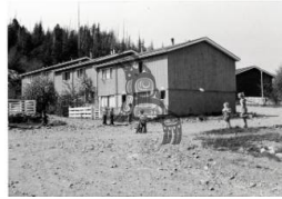
Title: Tasu Date: 1974 Medium: Prints