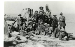
Title: North Beach Picnic Primary Maker: Rosenplanter, Fred Medium: Prints