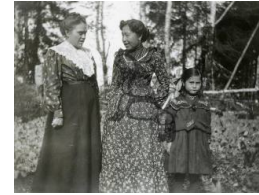
Title: Sandspit Ladies Medium: Prints