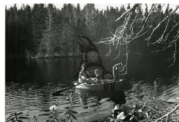
Title: Dead Tree Point Date: 1955 Primary Maker: Burge, Nettie Medium: Prints