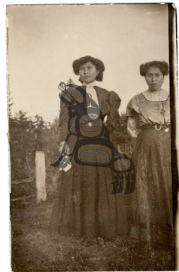
Title: Old Massett - Women Date: 1910 Primary Maker: Herbert B. Tschudy Medium: Prints