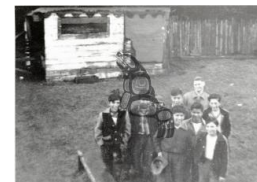
Title: Skidegate Primary Maker: Burge, Nettie Medium: Prints