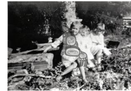
Title: Three Girls Date: u/k Primary Maker: u/k Medium: Prints