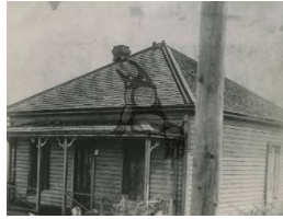
Title: Sandspit House Medium: Prints