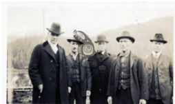
Title: Five Men - Portrait Medium: Prints