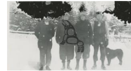
Title: Tlell Group Medium: Prints