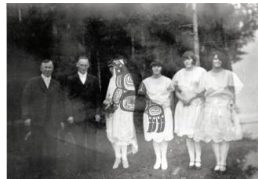
Title: Rudges and Neaubauers at wedding Date: u/k Primary Maker: u/k Medium: Prints