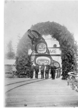
Title: Ikeda Bay- Welcome Arch Date: 1908 Primary Maker: Provincial Archives Medium: Prints