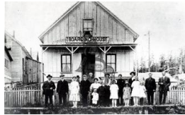
Title: Queen Charlotte City Boarding Houses Date: 1911 Medium: Prints