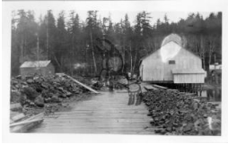
Title: Naden Harbour Date: 1911-1943 Medium: Prints