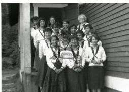
Title: Skidegate - Canadian Girls in Training Date: 1953 Primary Maker: Burge, Nettie Medium: Prints