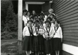
Title: Skidegate - Canadian Girls in Training Date: 1953 Primary Maker: Burge, Nettie Medium: Prints