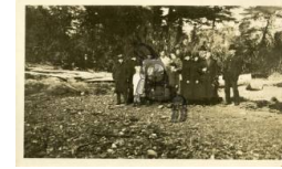
Title: Group Photo - Baptismal Party, Alaska Date: 1921 Primary Maker: Watson, T. H. Medium: Prints