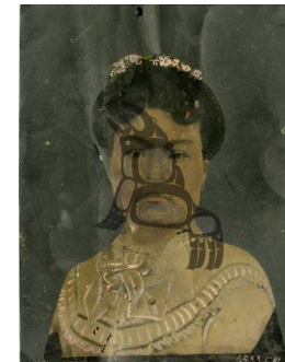
Title: Unknown Asian or First Nations woman Date: circa 1900 Medium: Tin print with painted embellishments