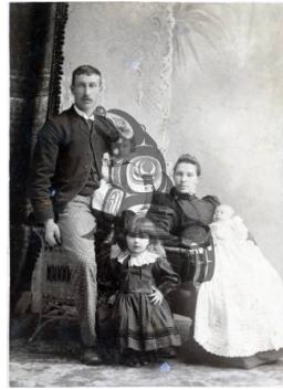
Title: Haida Gwaii Residents