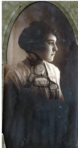
Title: Unidentified woman