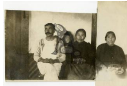
Title: Group Photo, Alaska Date: 1921-27 Medium: Prints