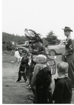
Title: Second Beach Date: 1951 Medium: Prints