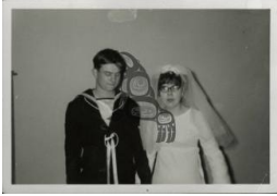
Title: Wedding Photo Medium: Prints