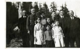
Title: Group Photo - Alaska Primary Medium: Prints