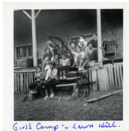
Title: Dead Tree Point Primary Maker: Burge, Ray Medium: Prints