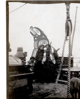
Title: Old Massett - Women and Child Date: 1910 Medium: Prints