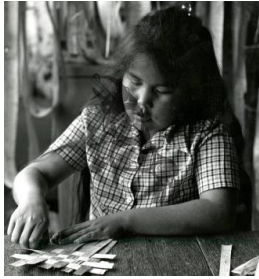
Title: Young Massett girl lacing cedar bark. Date: 1976 Primary Maker: Ulli Steltzer Medium: Prints