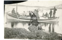
Title: Group Photo - Alaska Primary Medium: Prints