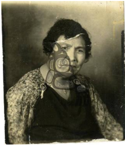
Title: Skidegate Haida residents circa 1900-30