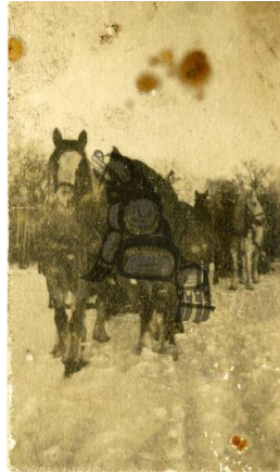
Title: Farming and Fish processing Date: mid 20th Century Primary Maker: u/k Medium: Prints