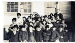
Title: Saxmun, Alaska Date: 1921 12 15 Medium: Prints