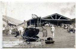
Title: Ships and Fishing Date: 1910's - 1950's Medium: Prints