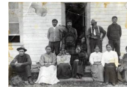
Title: Old Massett Group