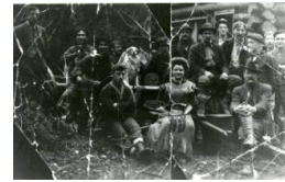
Title: Tow Hill Group Date: 1912 Medium: Prints