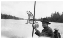
Title: Kumdis Slogh Primary Maker: J.H Baxter & Co. Medium: Prints