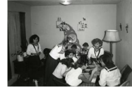
Title: Skidegate - Canadian Girls in Training Date: 1954 Primary Maker: Burge, Nettie Medium: Prints