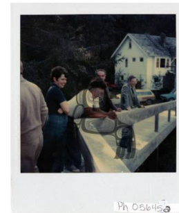
Title: Museum at Second Beach, Kay Llnagaay Date: 1980-1987 Primary Maker: u/k Medium: Prints