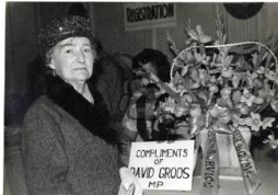
Title: Photos of Haida Gwaii residents