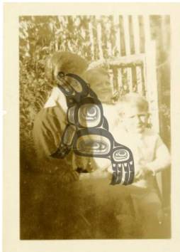
Title: Pioneer and Haida individuals