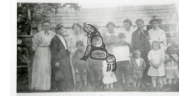
Title: Tlell Group Medium: Prints